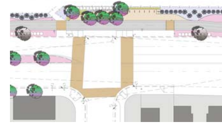
new. Bicyclist rest area at Astoria.