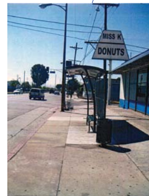
Astoria St. - West