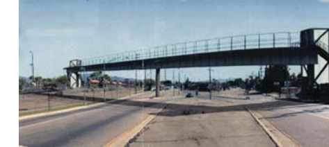
Pedestrian Overcrossing at San Fernando Road