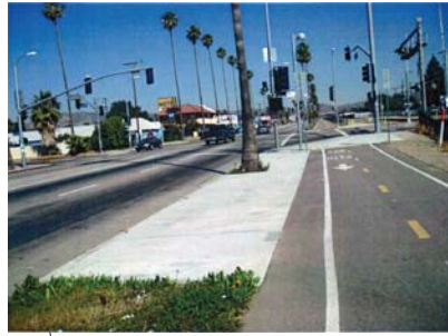
existing. bus stop new. bench + shelter + trash receptacle