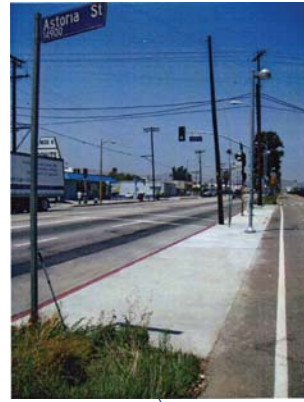
existing. bus stop new. bench + shelter + trash receptacle