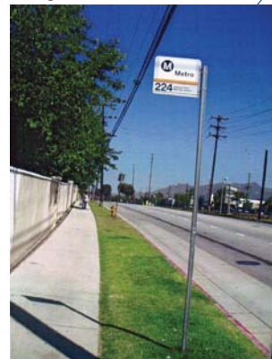
Sayre St. - West