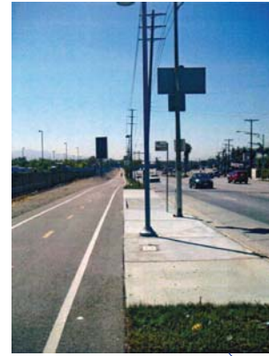
existing. bus stop new. bench + trash receptacle