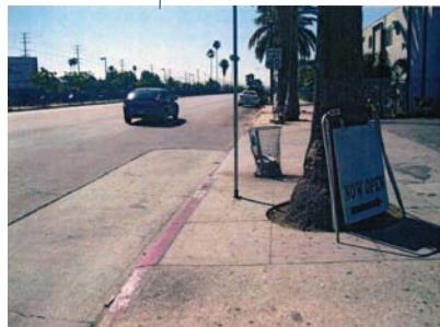
Polk St. - West