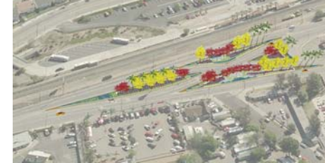
Sylmar Traffic Islands with New Landscape