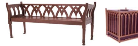
new. bench and trash receptacle